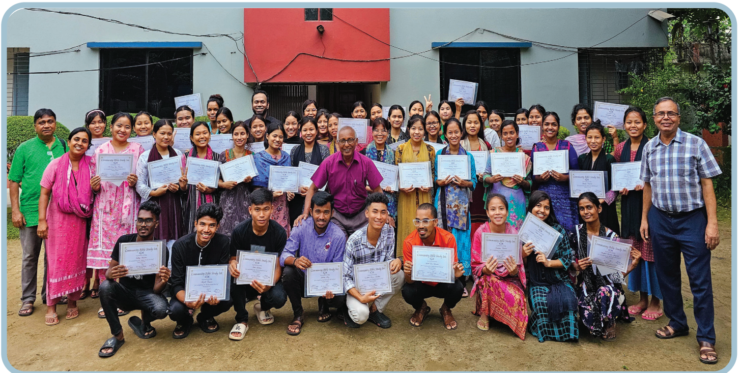
Leadership Workshop and Certificate Distribution among Joy Hostel Students

At present there are 52 boys and girls out of them 7 boys and 45 girls staying in Joy Hostel. 34 students are studying in Grade 11 and 18 girls are taking preparation for the final public examination of grade 12. The examination will start from June 30 and will continue August 8. Our last year's batch of grade 12 where 23 girls sat for the HSC Grade 12 public exam, 14 passed and remaining will give the improvement exam next year.