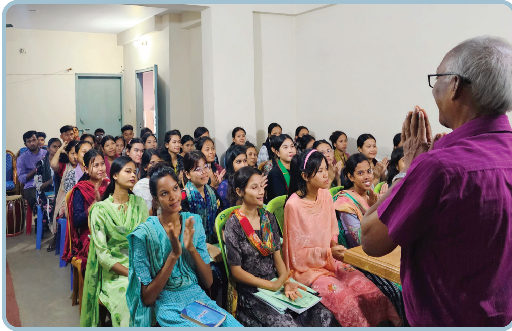
Leadership Workshop at Joy Hostel