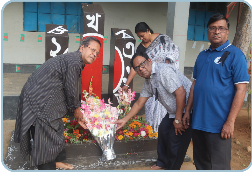
Observing International Mother Language Day 2024