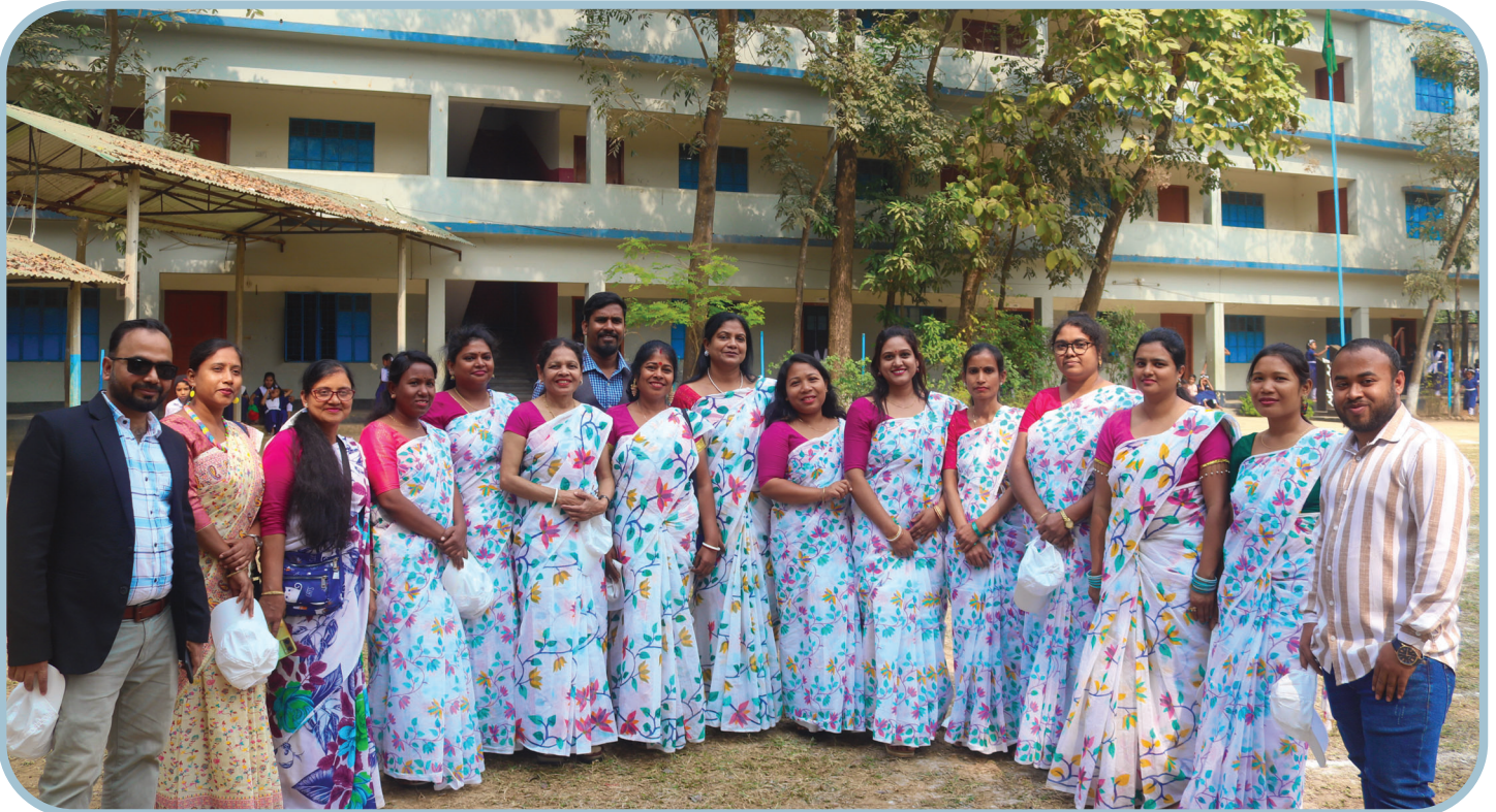
Samaritan Shishu Polli School Teachers