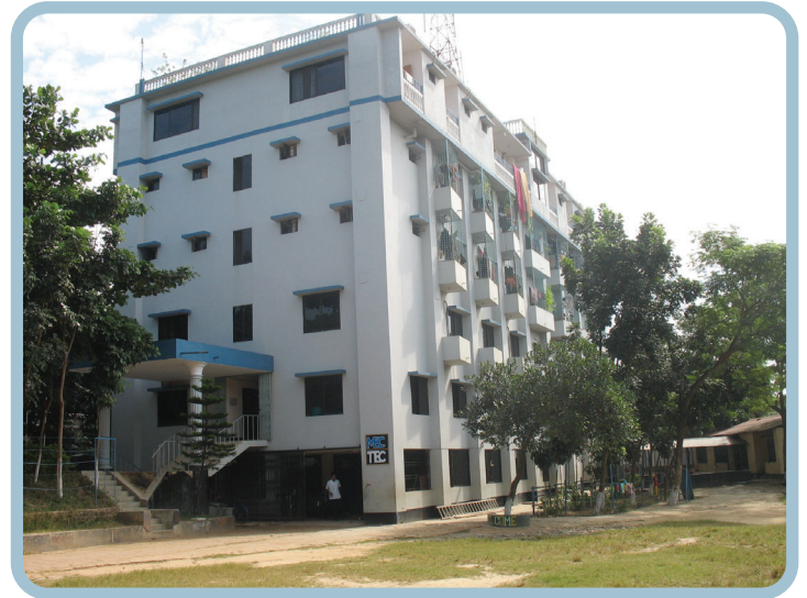
Boy's Dormitory & Office

In 2024, near about 75 new kids joined our program yielding the total number of 390 children (181 boys and 209 girls) at our children home campus studying from Nursery to Grade 10.